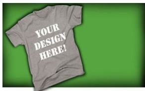
Think you have what it takes to win?

The Air Force recruits Airmen and retains families. The intent of this newsletter is to keep the military community abreast of the ever-changing issues and build a sense of community; comments are welcome.